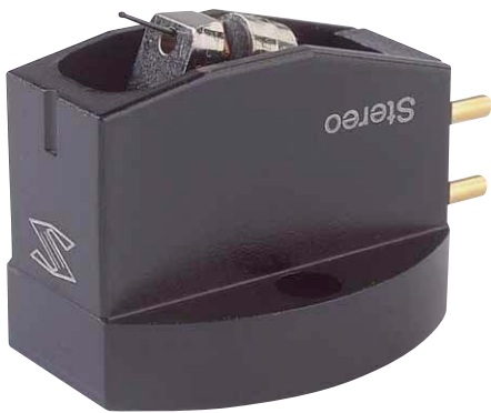
A milled aluminum body for a 500 euro MC - that's new

Both little Skyanalogs have done so much right that it couldn't go wrong tonally. The P-1 felt right at home in the twelve-inch Reed 3P, but it took a little time to get rid of a certain bulge. The 30 hours of break-in time specified by the manufacturer are not unrealistic. In terms of terminating impedance, I landed at 300 ohms, which was the best balance between a silky high frequency range and substantial bass reproduction. Operated like this, the 500-euro gem made a truly stunning impression. We start with the brand new sampler "Tribute To A Legend", dedicated to the Thorens turntable TD 124 DD. The entry "Jazzrausch" makes it immediately clear that the P-1 is by no means one of those anemic Schöngest MCs, but rather a looper bursting with vigor.